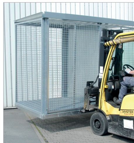
GFC-E/G M4 with dividing wall (accessories)