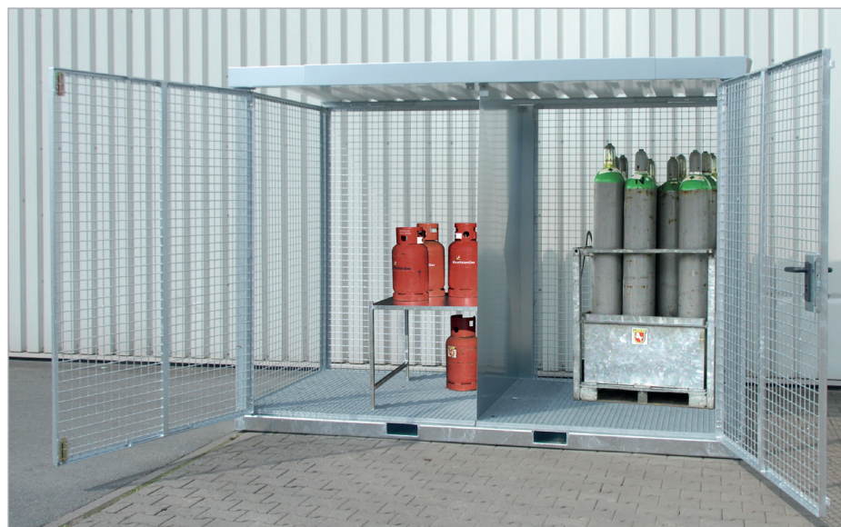
GFC-E/G M4 with dividing wall (accessories)